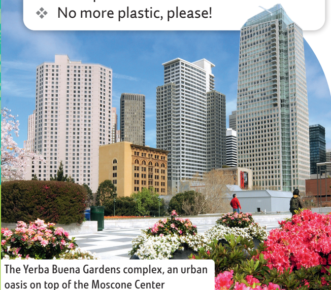
The Yerba Buena Gardens complex, an urban oasis on top of the Moscone Center

The Moscone Convention Center's roof has the largest municipally owned 3 solar power installation in the USA. This solar power system reduces smog, acid rain and global warming. Each year, the solar power generated by the system reduces carbon dioxide emissions by 35,000 tons (the equivalent of not driving 7,000 cars). Similarly, Oracle Park, home to the San Francisco Giants, is one of the most sustainable stadiums in the US and, in 2007, was the first major league 4 baseball stadium to install solar panels.